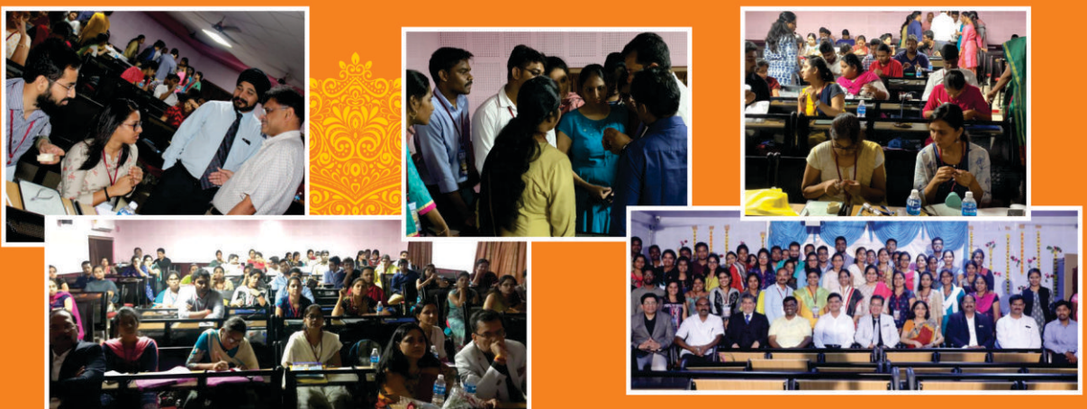
Lenora Institute Of Dental Sciences, Rajahmundry (AP)