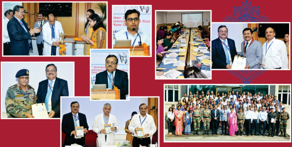
Centre for Dental Education & Research, AIIMS, New Delhi