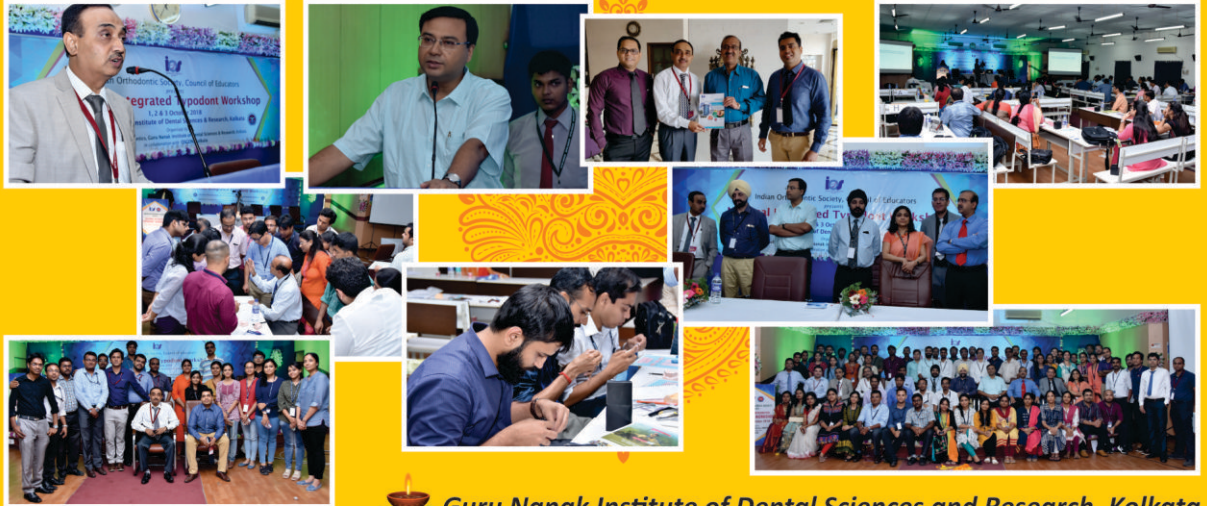
Guru Nanak Institute of Dental Sciences and Research, Kolkata